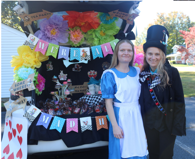
Alice in Wonderland