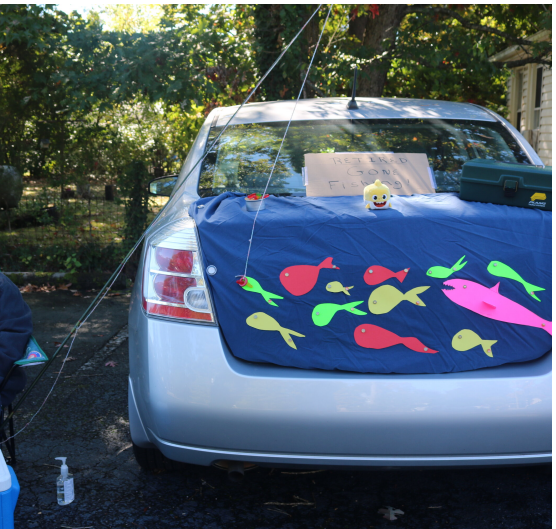
Retired: Gone Fishing