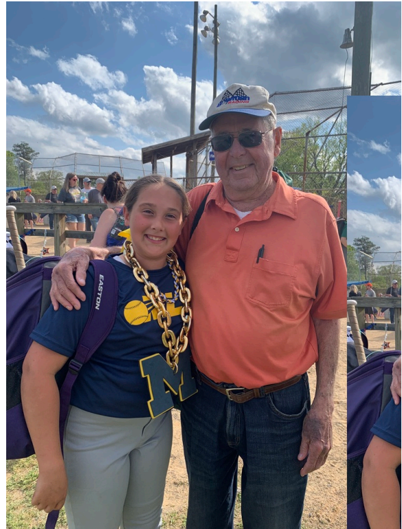
Softball MVP at Mechanicsville Little League!