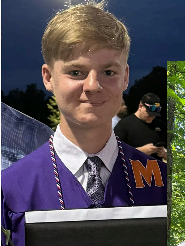
High School Graduation