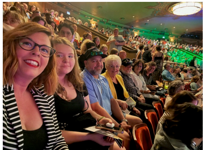
Saw BeetleJuice at Altria Theatre!

On the next few pages you will find all of the photos that were sent in for the month of July by the congregation. We hope you enjoy!