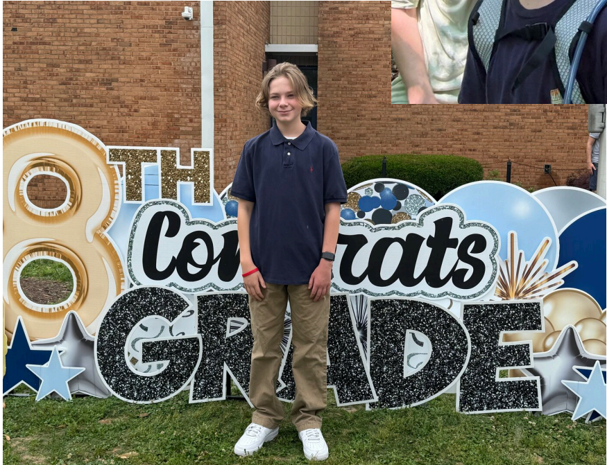
Middle School Graduation