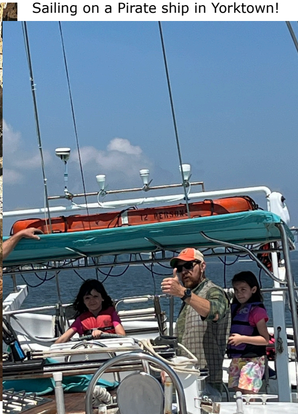
Sailing on a Pirate ship in Yorktown!