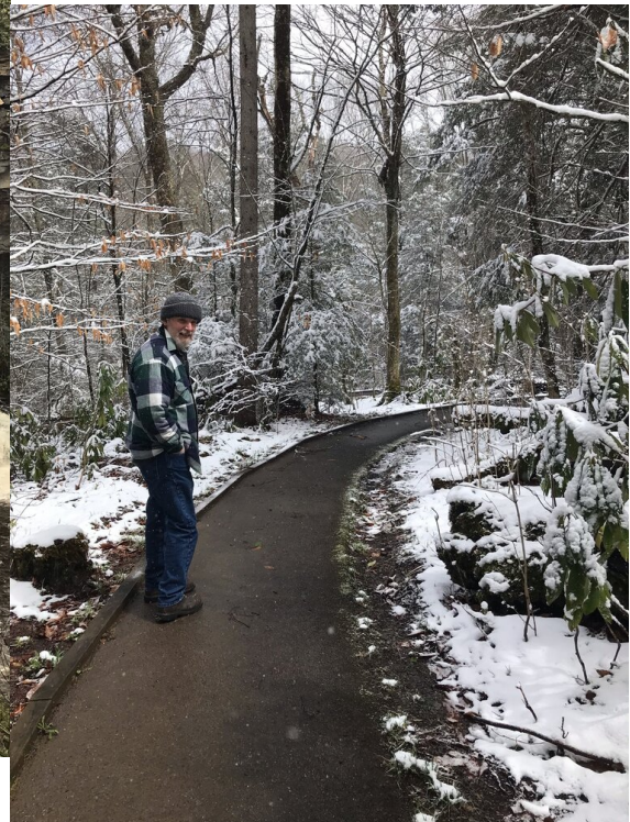
Hillsboro, West Virginia