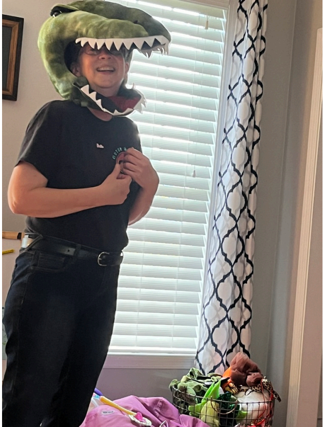
Playing dress up!