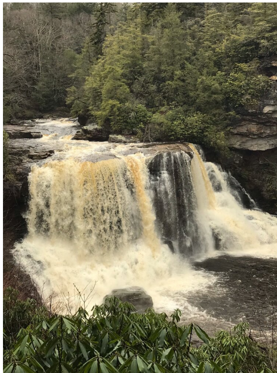
Blackwater Falls State Park in West Virginia