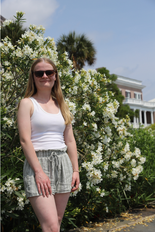
The Battery in Charleston, South Carolina