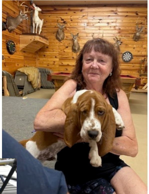
Spending time with our furry friends!