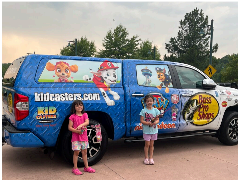
Meeting Skye & Marshall from Paw Patrol at Bass Pro.

For the months of July & August we are asking the congregation to send in photos of what they have been up to this spring/summer. We would like to thank everyone who participated this month. If you have some photos you would like to send in for the month of August please email or bring them up to the church no later than July 20th.