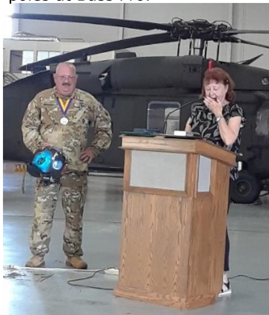
Retirement ceremony and last flight in the Army as a Blackhawk Helicopter Instructor.