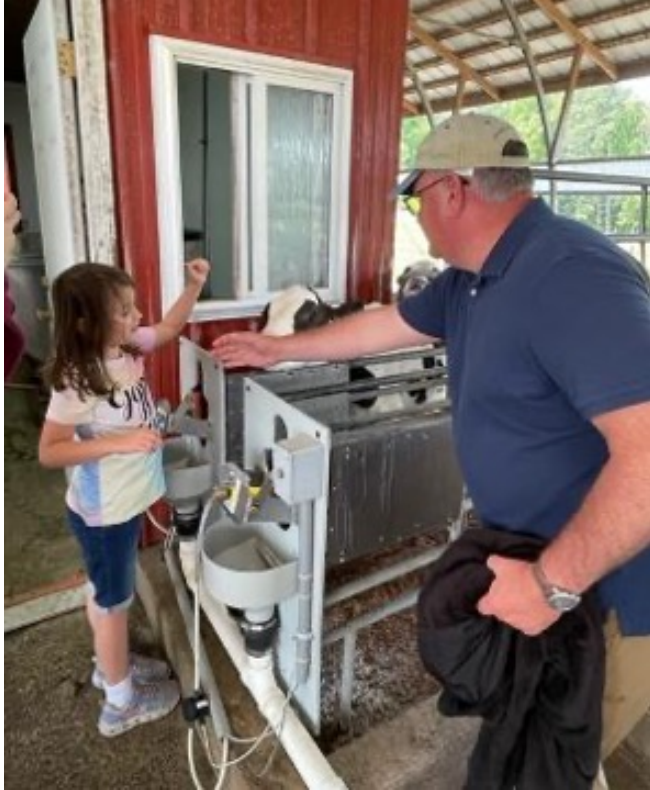
Visiting Richlands Farm & having a picnic!