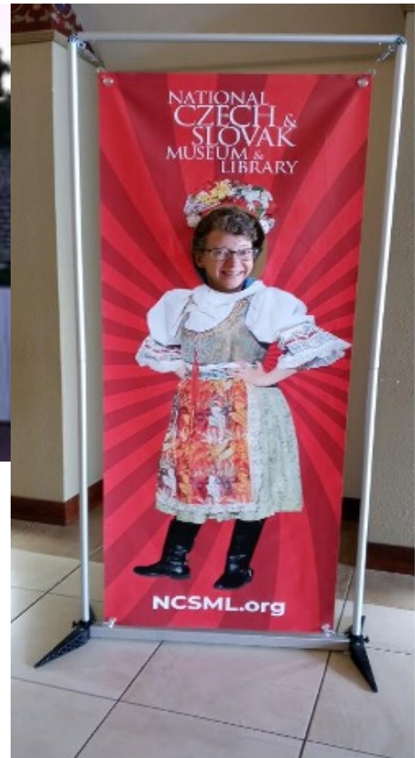
Cedar Rapids, Iowa