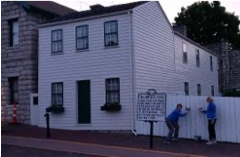
Pretending to whitewash the Tom Sawyer Fence in Hannibal, Missouri.